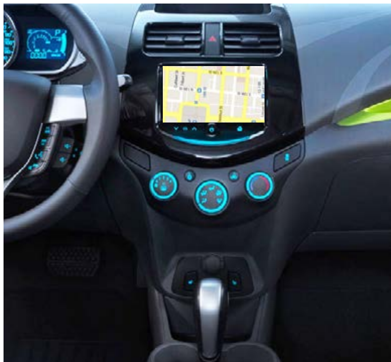
8" NEW STYLE NAVIGATION RADIO (1-PIECE RADIO)