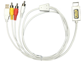
VCIP5 HDMI to RCA Adapter