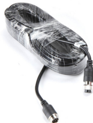
10M Extension Cable