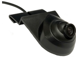
Third brake light mount cargo camera