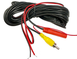
20" extension cable