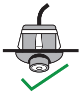
Under Lip Mount