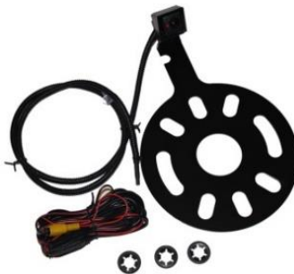
CCH-01M SPARE TIRE MOUNT CAMERA with MOVING LINES