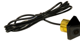
CUL-03 Lip Mount Camera