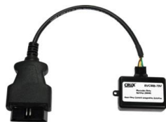
MB-78V OBD Coder