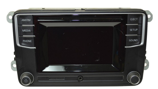
2017 Beetle Radio