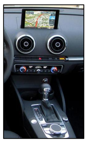
2015 Audi A3