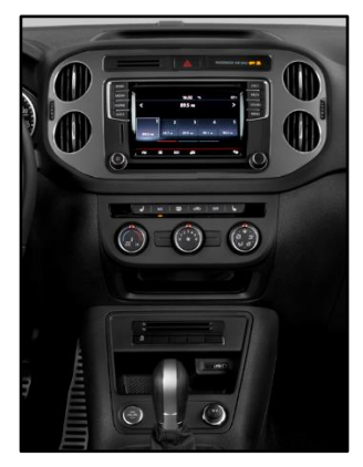
2016 VW Tiguan