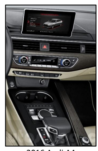
2016 Audi A4