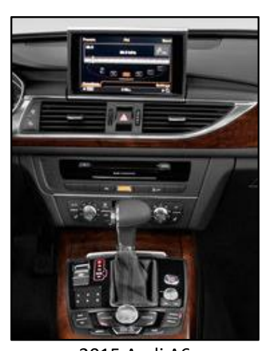
2015 Audi A6