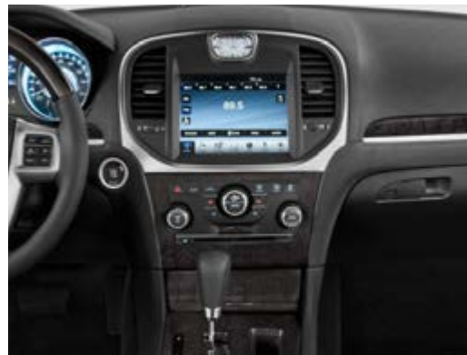
8.4" U-CONNECT RADIO/ 2-PIECE RADIO