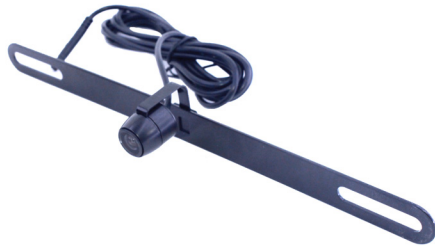
CLP-12M License Plate Camera