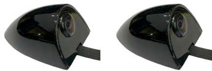
CSV-01 Fender Mount Camera (1 Pair)