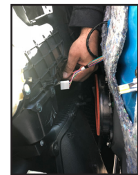
4. Unhook the door panel by pulling it upward. Unplug the speaker and doorlock harness.