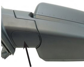
5. Use a hooked pick tool to remove the OEM side mirror cover. Fish the camera cable through the hole.