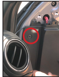
3. Use a plastic pry bar to remove the window sail. Remove the trim panel clips.