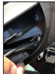
6. Tuck in the camera cable inside the cavity and snap in the CSV-CVN side mirror cover with camera.