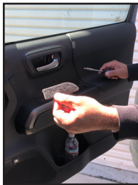
1. Remove the door pull and remove door panel the screws.