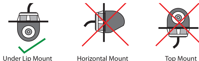
Under Lip Mount