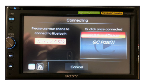
ACP-WL Connection Screen