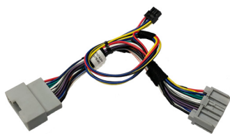
BTCCR-35M Vehicle Harness