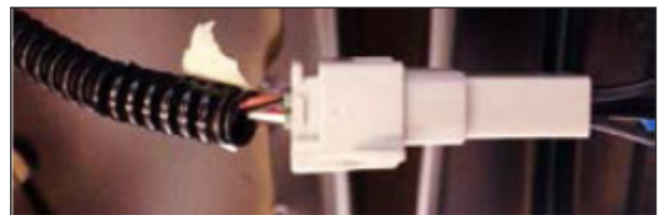
Factory 4-Pin connector