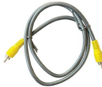
Video Cable (Male to Male)