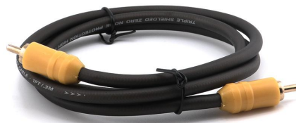
Video Cable (Male to Male)