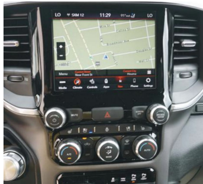
2020 RAM 1500