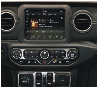
2020 Jeep Wrangler

**Some Jeep Renegade & Jeep Compass vehicles have an issue with the factory dashboard so door chimes, interior/alarm, turn signals, & hazard audible chimes do not work or are inaudible. Therefore, when you use this interface those issues will still persist. This is a factory speaker wire issue NOT SWRCR-59LV interface.